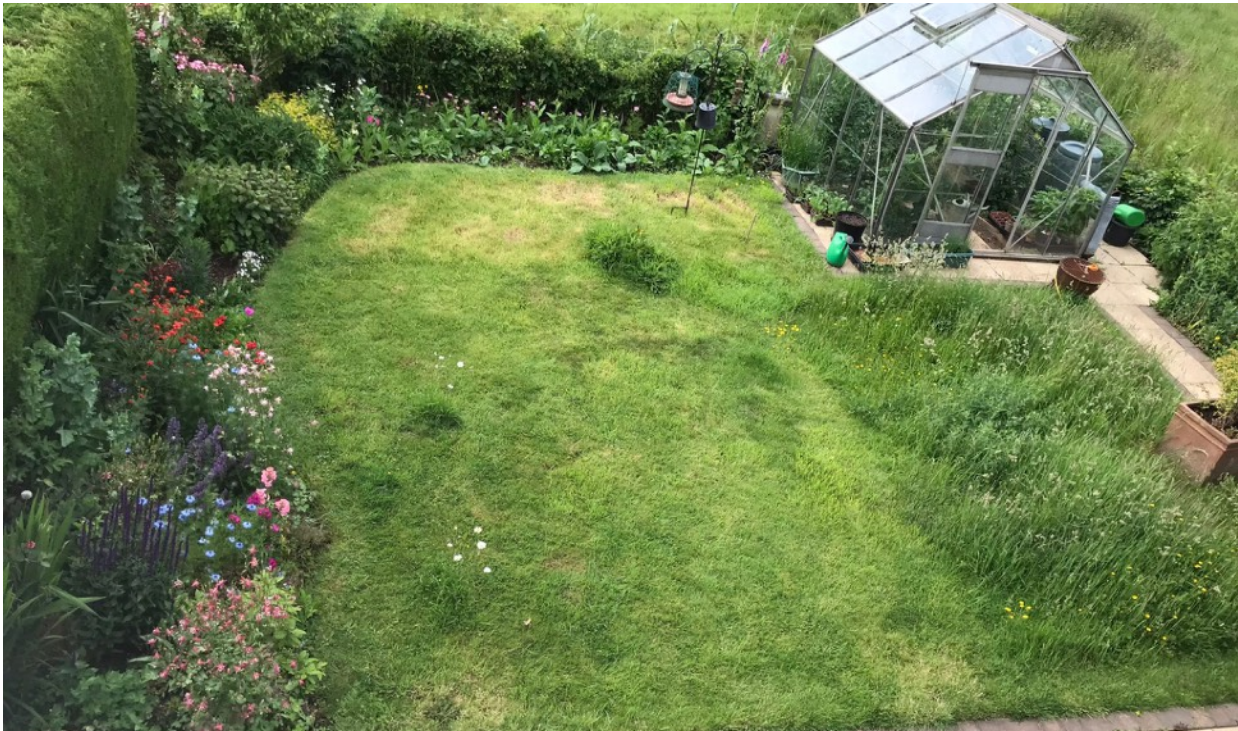
Richard's back lawn from a bedroom window. The area on the right has not been cut since April. In flower in May were buttercups, common vetch and cranesbill. In June clover will begin to flower. The area at the back with the bird feeder had its first cut on 2nd June. The largest section on the front left is cut fairly often but has 'flower islands' with buttercups and ox-eye daisies. The biggest clump of green is knapweed.

medium setting to give a space for putting the garden chairs out on hot days. One half of the remainder wasn't cut until early June, within an hour of being cut it had at least 10 starlings feeding on it. The rest had an occasional cut with the mower in March and April on its longest setting and will get no cuts in May, June, July and August so there will always be an uncut area. We have learned to appreciate that grass going off to seed can look as attractive as flowers and is just as important for insect and birds. This area currently has buttercups, cranesbill, daisies and common vetch in flower, red clover will soon be in flower too. The common vetch was introduced by collecting seeds and just dropping in the lawn: it is a great favourite with bumble bees.