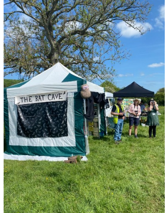
The Bat Cave was full of information about bats, especially the Greater Horseshoe bats that are special to the site.