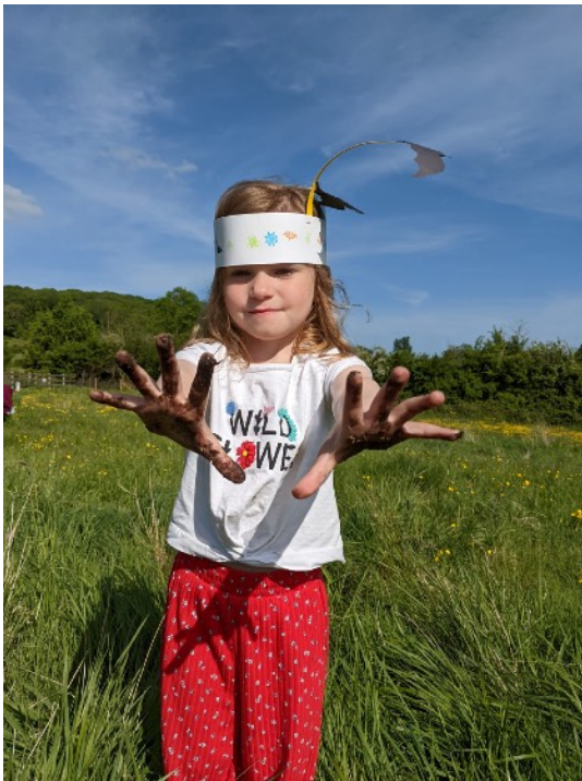
Making seed balls - a great excuse to get your hands dirty for nature.