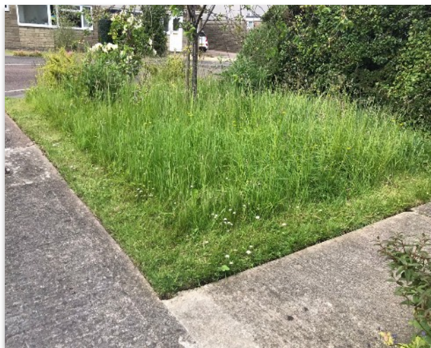
Richard's front lawn May 2022

The lawn is on the north side of our house and the grass struggled to compete with moss, and with harsh clay soil the flowers were never very successful. That year it had been miserable weather and I hadn't cut the grass for a while, it was at that stage where 'it needed a cut' before we went away but it didn't get done. When we arrived home, much to our surprise, among the grass, daisies and dandelions there were cuckoo flowers in bloom. We weren't even aware we had cuckoo