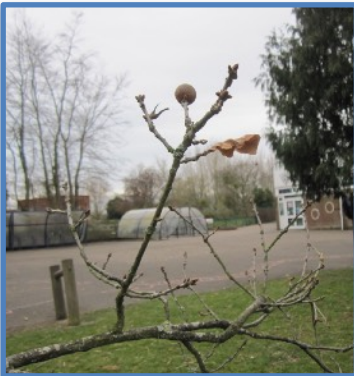
Marble gall on oak planted by YACWAG St Andrew's School 2012

Oaks are prone to galls. In medieval Britain oak galls (known as oak apples) were collected to make dyes and ink. Marble galls from Italy were introduced to Devon in the 1830s for ink making and by 1860 could be found all over Britain as far north as Scotland. There was concern that this introduction would reduce the crop of acorns, which were an important winter food for pigs, but that was unfounded. More recently the abundance of the knopper gall, which has only been in England since the 1960s, was similarly feared likely to reduce acorn production, but after an initial boom, the tiny wasp that makes the knopper galls is not threatening the continuity of our oaks. The knopper gall wasp requires the Turkey oak to complete its life-cycle.