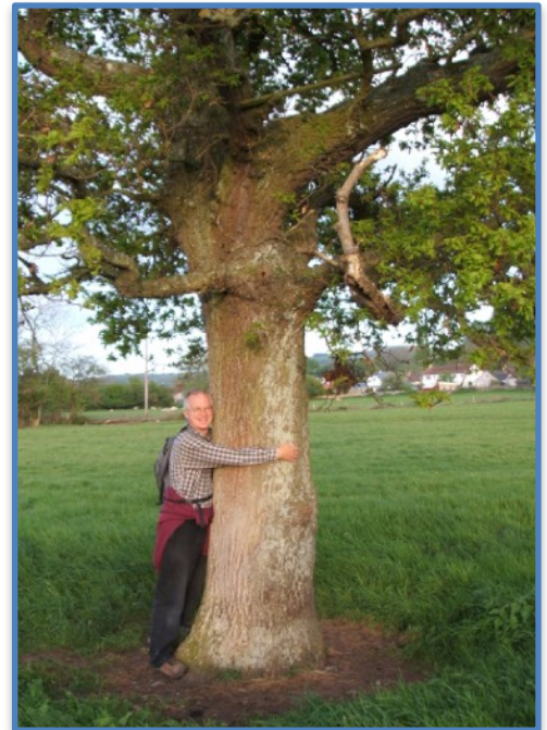
Giving Harry's Oak a hug in 2005

Photo right: Memorial oak tree planted in December 2020