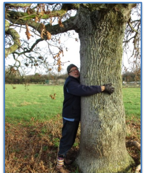
And a bigger hug in 2016