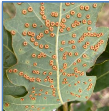
Silk button spangle galls on underside of Harry's Oak leaf. Each gall contains at least one tiny wasp larva.