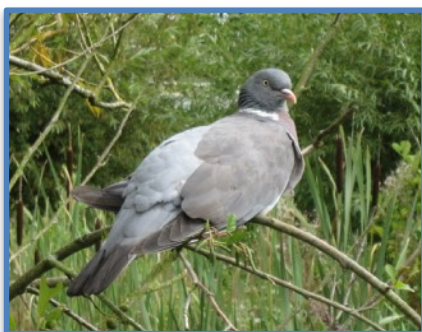
Wood Pigeon - joint top bird, seen in all participating gardens.