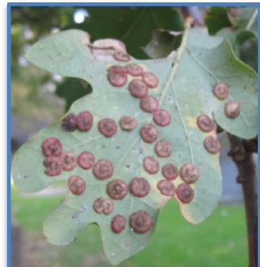
Smooth spangle galls under a leaf. These are often found on the same leaves as silk button spangle galls.

There are literally hundreds of gall-making wasps and flies busy around Harry's Oak in the spring. These are great food for birds like swallows, swifts and martins and for bats.